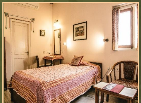
Economic Single Room

Spacious, clean and well furnished rooms at Great Value from INR 1400 – 2400 per night