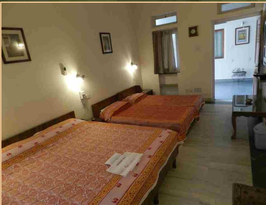
Family Deluxe Room