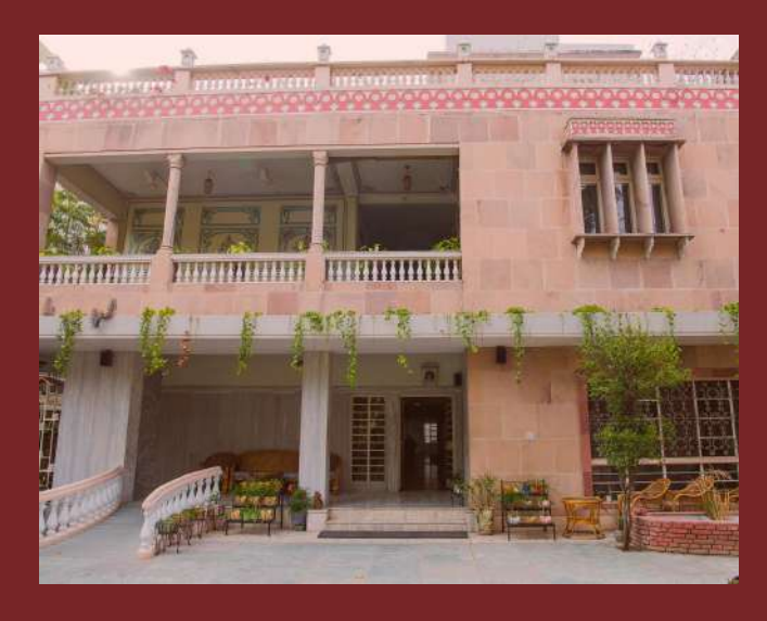
Arya Niwas Jai Niwas Tara Niwas