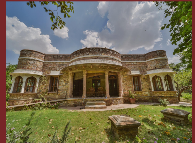
Shri Vatika Amber

www.jaipurjantarhostel.com / +91 9829040897